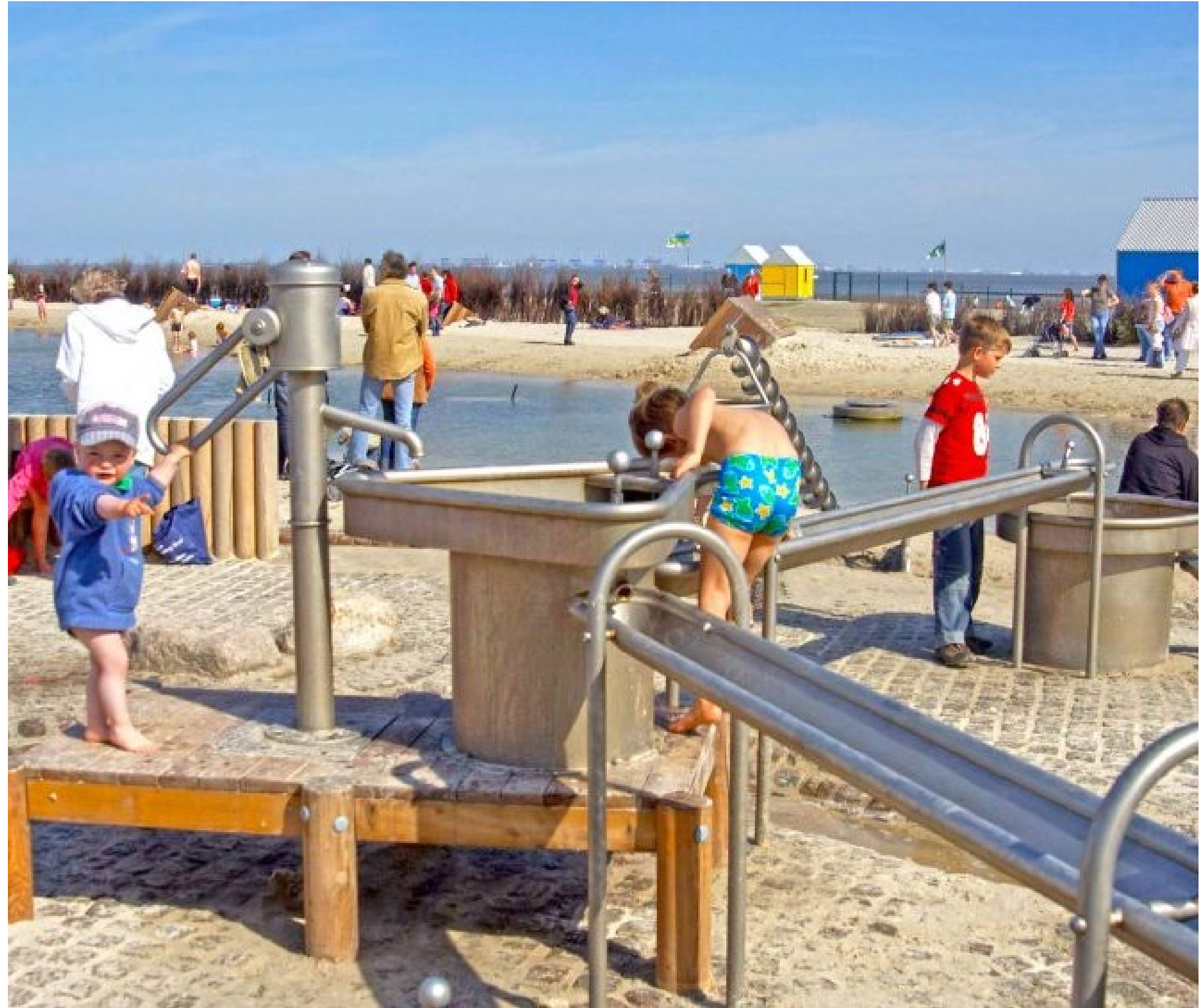
GORIC MEANDER MULTI-CHANNEL SYSTEM ROANOKE SOUTH MEADOW