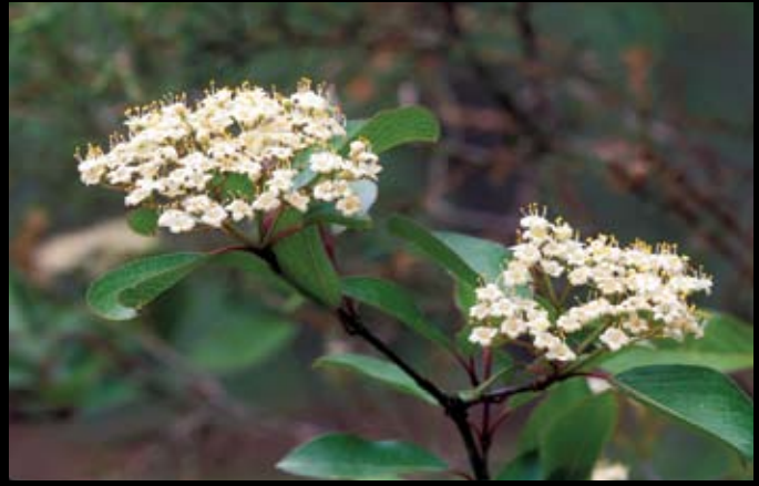
Blackhaw ( Viburnum prunifolium ) This multi-stemmed shrub produces flat heads of white flowers in the spring. Birds eat the purple-black fruit in the fall. The leaves develop a beautiful red color in fall. Two plants are required for cross pollination and fruit set.