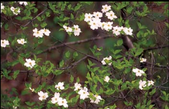
Flowering dogwood ( Cornus florida ) This small tree with spreading horizontal branches puts on distinctive white flowers in mid-April and yields clusters of glossy red fruit in fall. Leaves give you deep red fall color; red berries feed the birds and small wildlife.