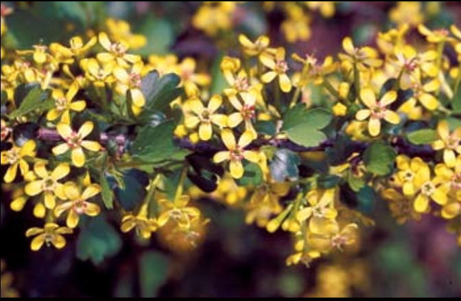
Golden currant ( Ribes odoratum ) In spring, golden yellow flowers appear and emit a strong, clove-like fragrance. Birds and small animals eat the round, black berries formed June through August.