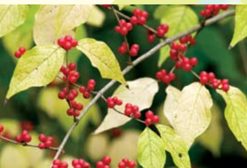
Bush honeysuckle's abundant flowers yield loads of berries in the fall—which birds eat and drop, further infesting the local area.