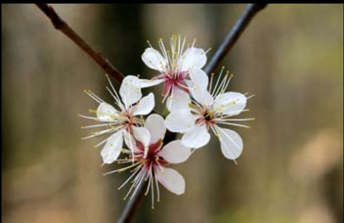
Wild plum ( Prunus americana ) The pure white, overwhelmingly fragrant flowers are among the first to open in spring. Birds and wildlife love the small, round, edible plums in late summer and fall.