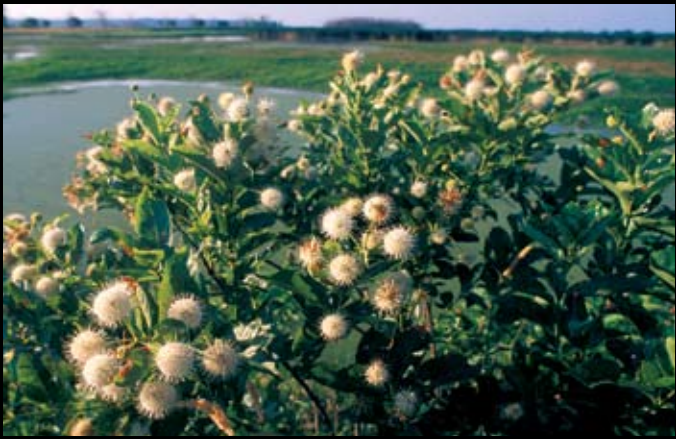
Buttonbush ( Cephalanthus occidentalis ) Hundreds of ball-shaped, creamy white flowers form in August. This shrub provides food and cover for butterflies, songbirds and beneficial insects.