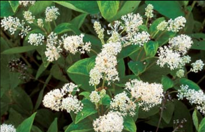
New Jersey tea ( Ceanothus americanus ) Great butterfly nectar plant for hot, dry sites. Billows of delicate white flowers in spring yield clusters of small black fruit in July and August.