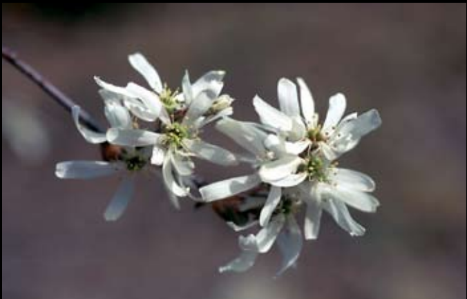
Serviceberry ( Amelanchier arborea ) Fragrant white flowers in April give rise to very flavorful, purple-black, berrylike fruits relished by both songbirds and people. This lovely tree has colorful fall foliage in a blend of orange, gold, red and green.