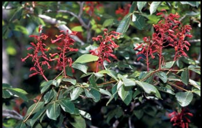
Red buckeye ( Aesculus pavia ) Spikes of showy red flowers attract and feed ruby-throated hummingbirds in spring. Foliage drops naturally in late summer and brown, egg-shaped fruit appear in the fall.