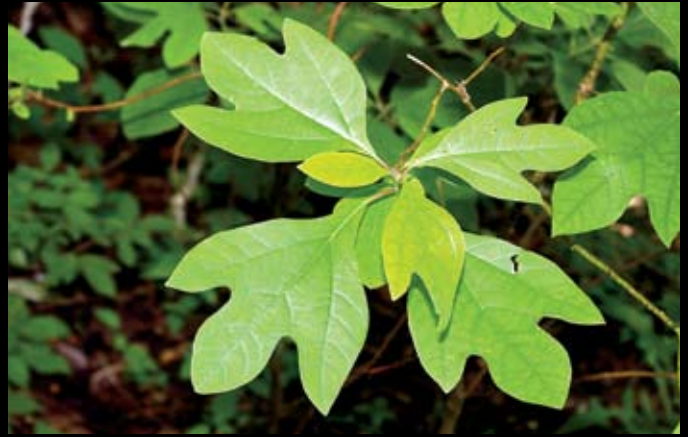
Sassafras ( Sassafras albidum ) This medium-sized tree produces clusters of small yellow flowers in early spring and fragrant, mitten-shaped leaves that turn deep orange to scarlet and purple in the fall. It's a host plant for many moths and butterflies.