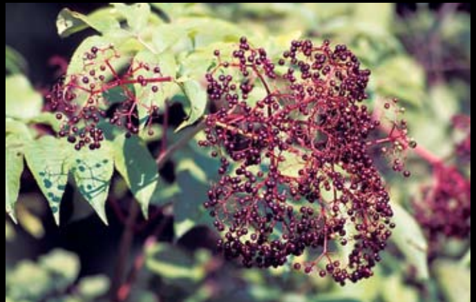
Elderberry ( Sambucus canadensis ) Large, flat showy clusters of white, fragrant flowers in spring give way to clusters of dark purple-to-black, berrylike fruits in late summer and fall. Birds and mammals eat the berries—unless you use them to make jelly, pie and wine.