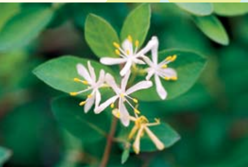
Bush honeysuckle blossoms are white to yellow, fragrant and bloom in April and May. The leaves are narrower and more pointed than native honeysuckle's, and they are attached by short, slender petioles to the main stem.

Not to be confused with Missouri's native vine honeysuckles, invasive bush honeysuckles such as Morrow's and Amur are shrubby natives of Asia. Here in the United States, where they have no natural controls, they leaf out in April, grow fast, spread fast and form dense thickets that crowd out Missouri's native forest plants. If you've got a giant green thicket in your woods, you may have a bush honeysuckle infestation.