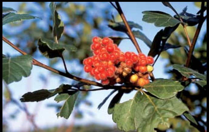
Fragrant sumac ( Rhus aromatica ) This low-spreading shrub bears yellow-green flowers before leaves emerge. Clusters of fuzzy red fruit form on female plants in August and may persist into winter. Birds and mammals feed on the fruit. Leaves turn bright red-purple in fall.