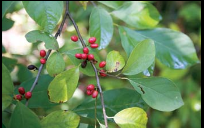
Spice bush ( Lindera benzoin ) A broad, rounded multi-stemmed shrub covered with fragrant yellow-green flowers in early spring. Aromatic leaves turn deep yellow-gold in fall. Birds feed on the small red berries.