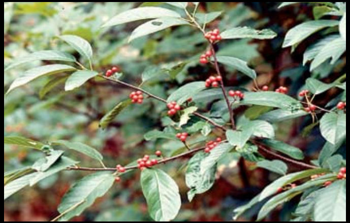
Carolina buckthorn ( Rhamnus caroliniana ) Attractive to bees, butterflies and birds, this species can be grown as a small tree or large shrub. The leaves are a shiny, dark green with a pale underside. The bright red fruits stay on until October.