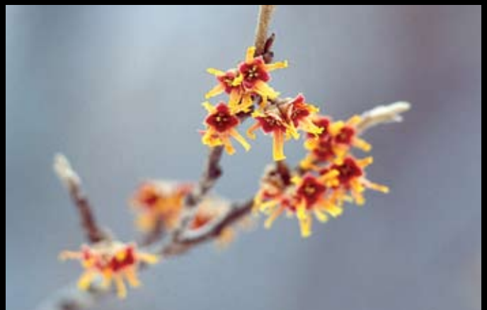
Vernal witch hazel ( Hamamelis vernalis ) This unique shrub flowers from late winter into early spring, when little else is blooming. The fragrant flowers are yellow to dark red, and have four short, strap-like petals. Turkey and ruffed grouse eat the seeds and flowers.