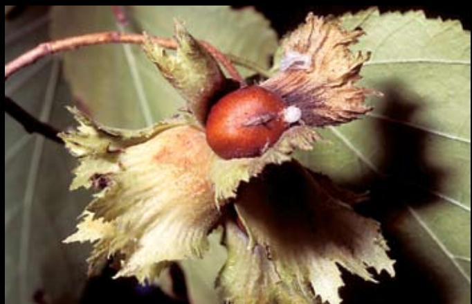
American hazelnut ( Corylus americana ) This attractively shaped, many-stemmed shrub with red-orange fall foliage and tasty nuts feeds quail, grouse, blue jays, squirrel and deer.