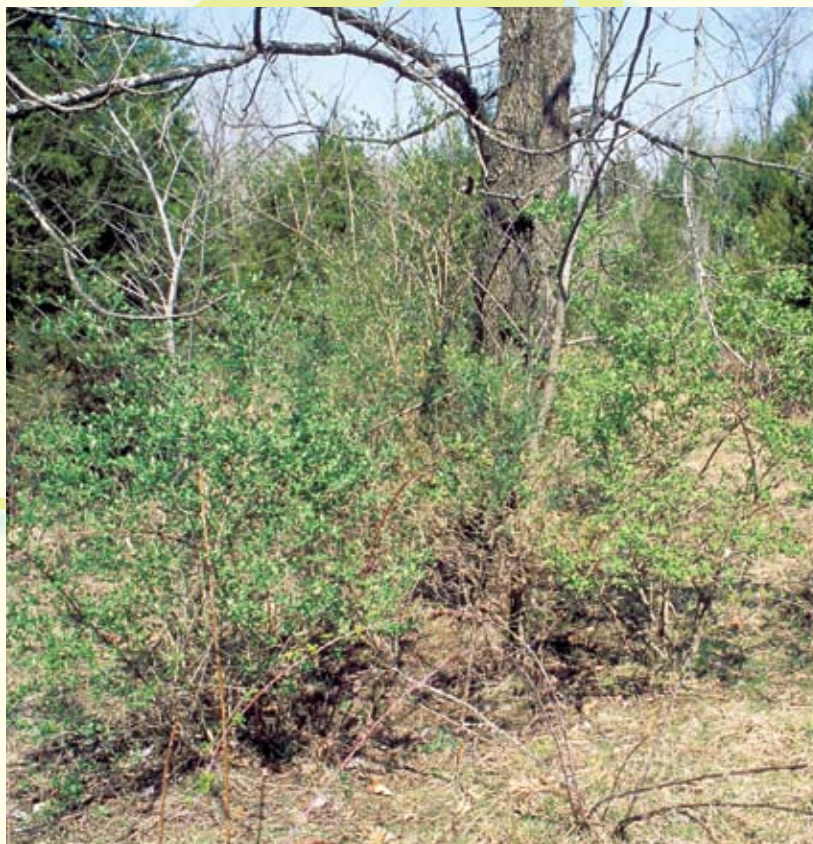
Bush honeysuckle thickets like this one are taking over Missouri's woodlands. Notice that it greens up before native shrubs and trees. This early green-up shades out everything growing underneath it.