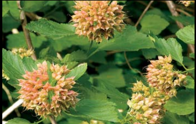
Ninebark ( Physocarpus opulifolius ) This handsome shrub produces clusters of white to pinkish flowers in May and June. Fruit in reddish drooping clusters feed birds in the fall. In winter, the bark on mature stems peels away in strips to reveal reddish-to-light-brown layers.