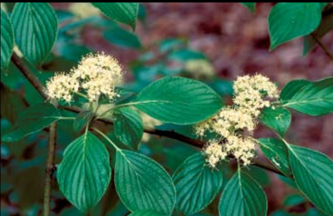
Pagoda dogwood ( Cornus alternifolia ) Spreading, low-branched tree with great horizontal habit and blue-black berries on red stems—a good alternative to cold-sensitive flowering dogwood in northern areas.