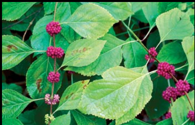
American beautyberry ( Callicarpa americana ) Deep pink blossoms yield bright purple berries that persist far into the winter, feeding birds and small mammals.

Choose native species that work for you and for wildlife. The shrubs listed here give your landscape beauty, co-exist peacefully with other native plant species and provide food and cover for butterflies, birds and wildlife. Shop for them via www.grownative.org , click on "Buyer's Guide."