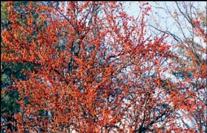
Deciduous holly ( Ilex opaca ) A real eye-popper, this small tree's striking red-orange berries brighten your winter landscape and feed birds, deer and small mammals until spring.