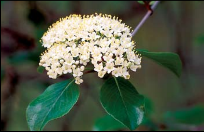
Rusty blackhaw ( Viburnum rufidulum ) Showy flat clusters of white flowers adorn the plant April-May. Drooping clusters of blue-black fruit with red stems form in September. Many types of birds and mammals eat the fruit. Leaves turn rich burgundy in fall.